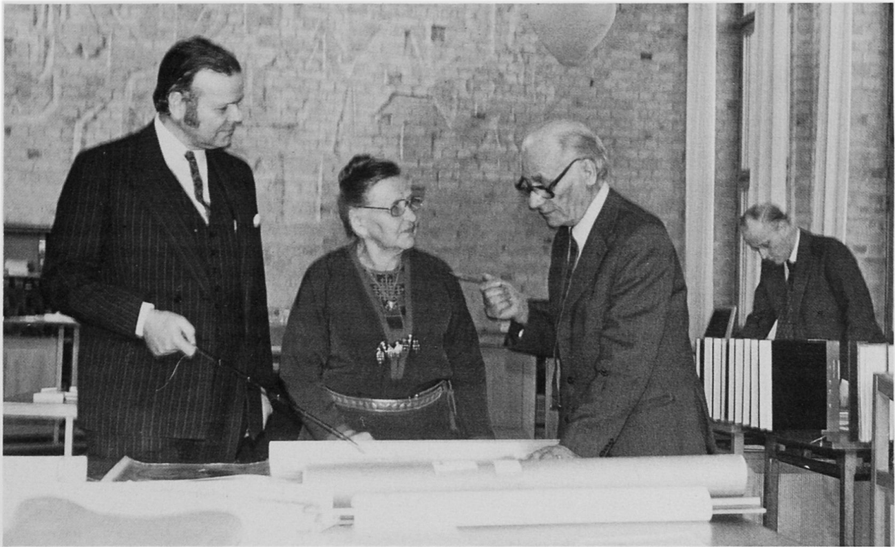
Fig. 2 Many decisive questions concerning Sámi rights have lately been actualized by means of litigation. The picture was taken during the hearing of the Taxed Mountains Case in the Court of Appeal in Sundsvall 1976. From left to right we see the Sámiombudsman, one South Sámi who attended as spectator, a key expert witness, himself a Sámi and professor in Sámi linguistics, and the legal counsel representing the Crown.

In conclusion we may point out that the Sámi codicil of 1751, unlike other legal documents, unites principles related to international law with those based on Sámi customary law. This connection makes the Codicil unique in our time; thereby it is constantly topical, being useful in the most diverse confrontations of interest.