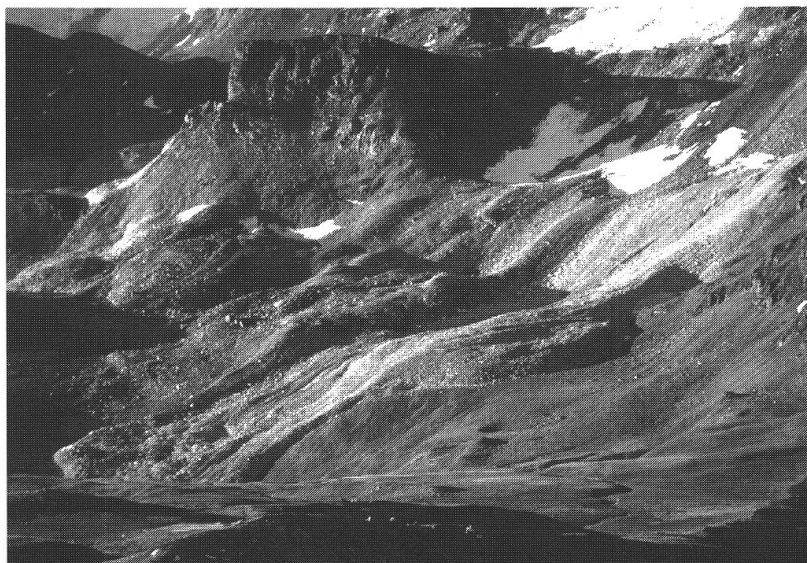
Fig. 1: The Lona glacier/rock glacier complex in the Valais Alps

Explanation: The snout of the formation consists of permanently frozen ground pushed down by a glacier that advanced during the Little Ice Age. Electrical measurements were carried out in this area in 1991. A strong degradation of the frozen ground was observed when repeating the measurements in 2002. The thawing of permafrost is the consequence of the historical dynamics of the formation.