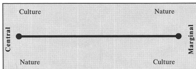
Fig. 3: The inversion of perspectives: conventional (above) and new way (below) of viewing marginality Die Umkehrung der Perspektiven: konventionelle (oben) und neuartige (unten) Sichtweise der Marginalität L'inversion des perspectives: démarches conventionnelle (en haut) et nouvelle (en bas) en matière de vision de la marginalité