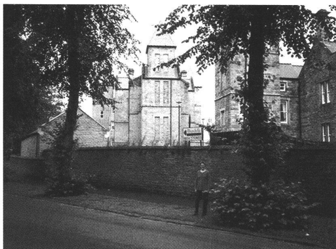
Photo 1: The original workhouse buildings and the surrounding stone wall

Les bâtiments originaux d'indigents, entourés d'un mur de pierre