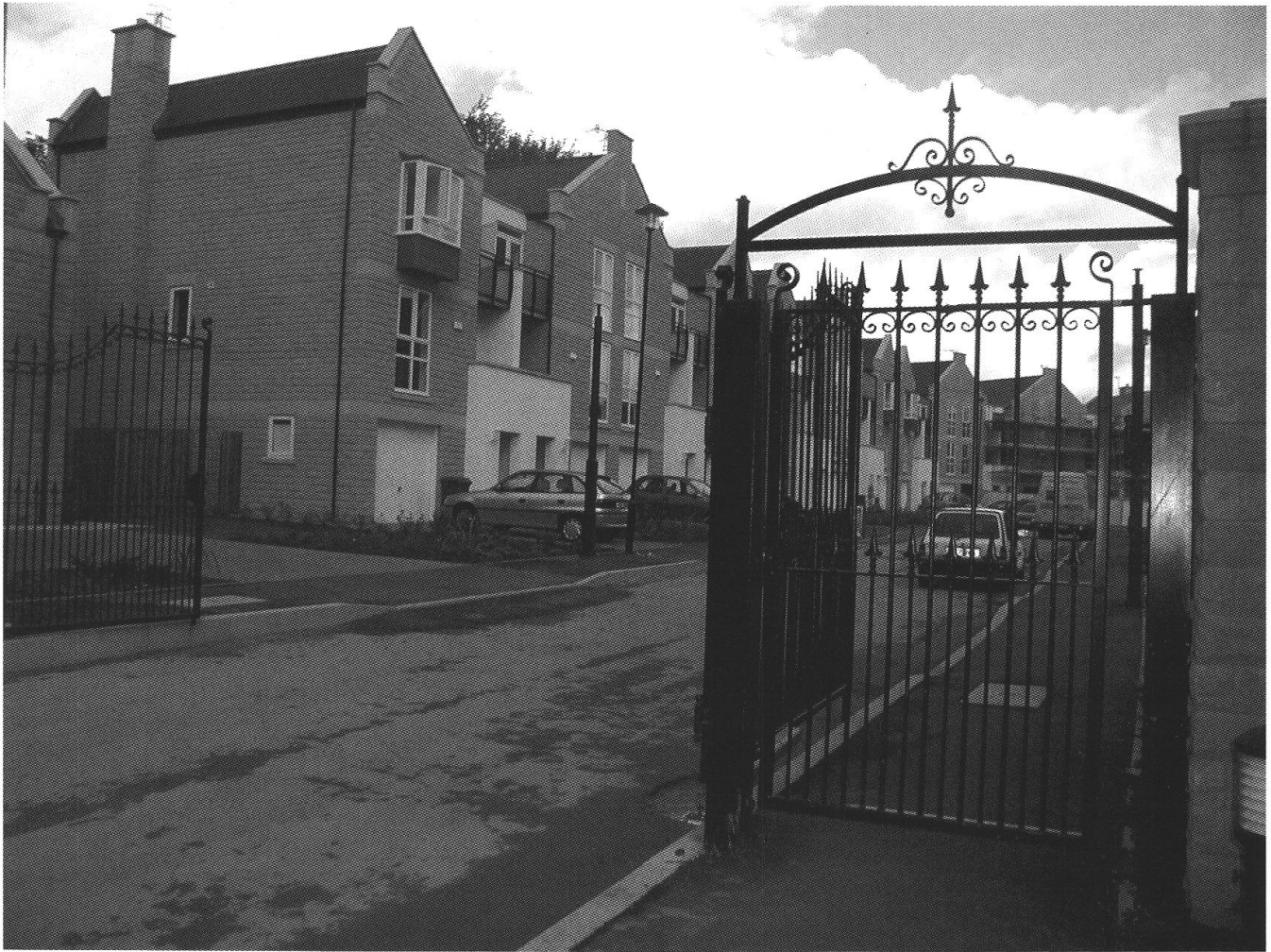
Photo 2: Newly built houses, and access gate Des immeubles nouveaux et une barrière d'entrée Neue Gebäude und eine Einfahrt mit Zugangsbeschränkung