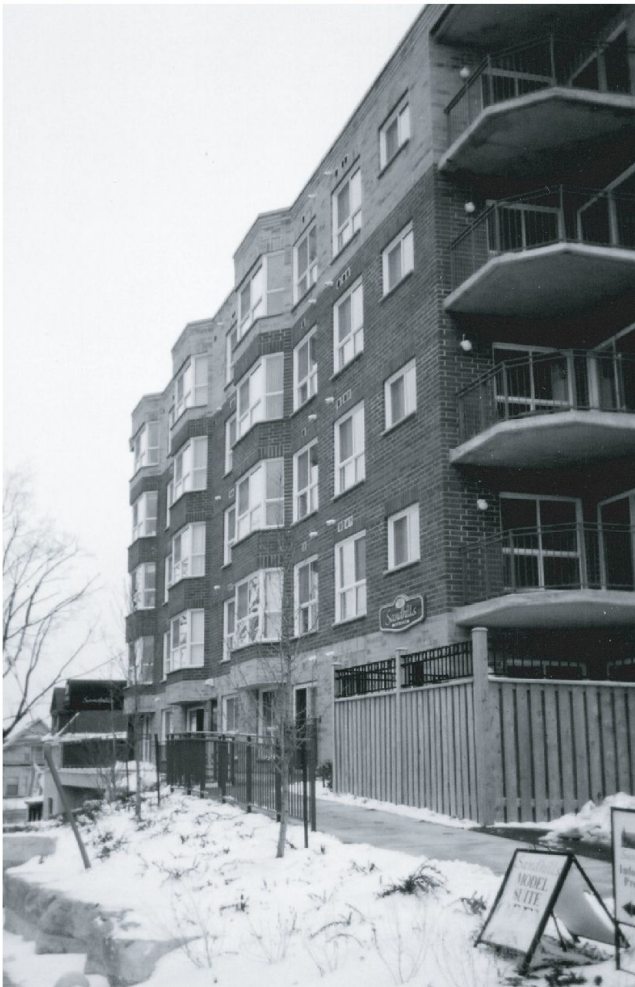
Fig. 2: An example of a non-profit retirement community

In order to analyze the types of images used to promote retirement community living, each sentence or phrase is classified into one of three categories: successful ageing, the physical aspects of community and age-related decline. A sentence or phrase that implies successful ageing is classified under the first heading: successful ageing. Successful ageing is suggested by sentences that refer to family and social roles, as well as activities that conjure up images in keeping with the idea of forestalling old age. Text depicting residents participating in group fitness activities, playing golf or tennis or shopping are examples. Sentences describing the location of the dwellings for sale and available on-site amenities are classified in a second category: physical aspects of the community. Images that indicate that the physical deterioration associated with increasing age cannot be avoided are classified under the heading «age-related decline». References to the availability of on-site medical services, intercom sys-