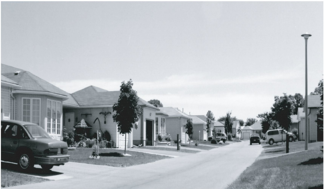
Fig. 3: Examples of the housing typically available in for-profit communities