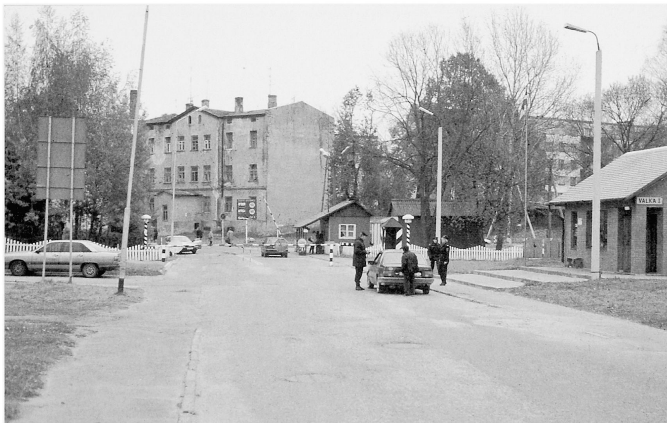
Fig. 3: The Valka/Valga border control as seen from Latvia towards Estonia, before the new EU arrangements Der Valka/Valga-Grenzposten von Lettland aus gesehen in Richtung Estland, vor den EU-Vereinbarungen Le poste-frontière de Valka/Valga vu de la Lituanie vers l'Estonie avant les accords de l'UE

Orthodox Church and Catholic Cathedral. On the other hand, several graveyards from Soviet times are located in Valka, with graves of ethnic Estonians, Russians and other nationalities. Before independence in 1991, it was quite common that both sport schools and sport clubs had members from both sides of the border. Today, Latvian pupils use to some extent the sport arena and the swimming pool in Valga. Besides language barriers and visa difficulties, border waiting time is a further hindrance to freer movement, especially for the non-citizens.