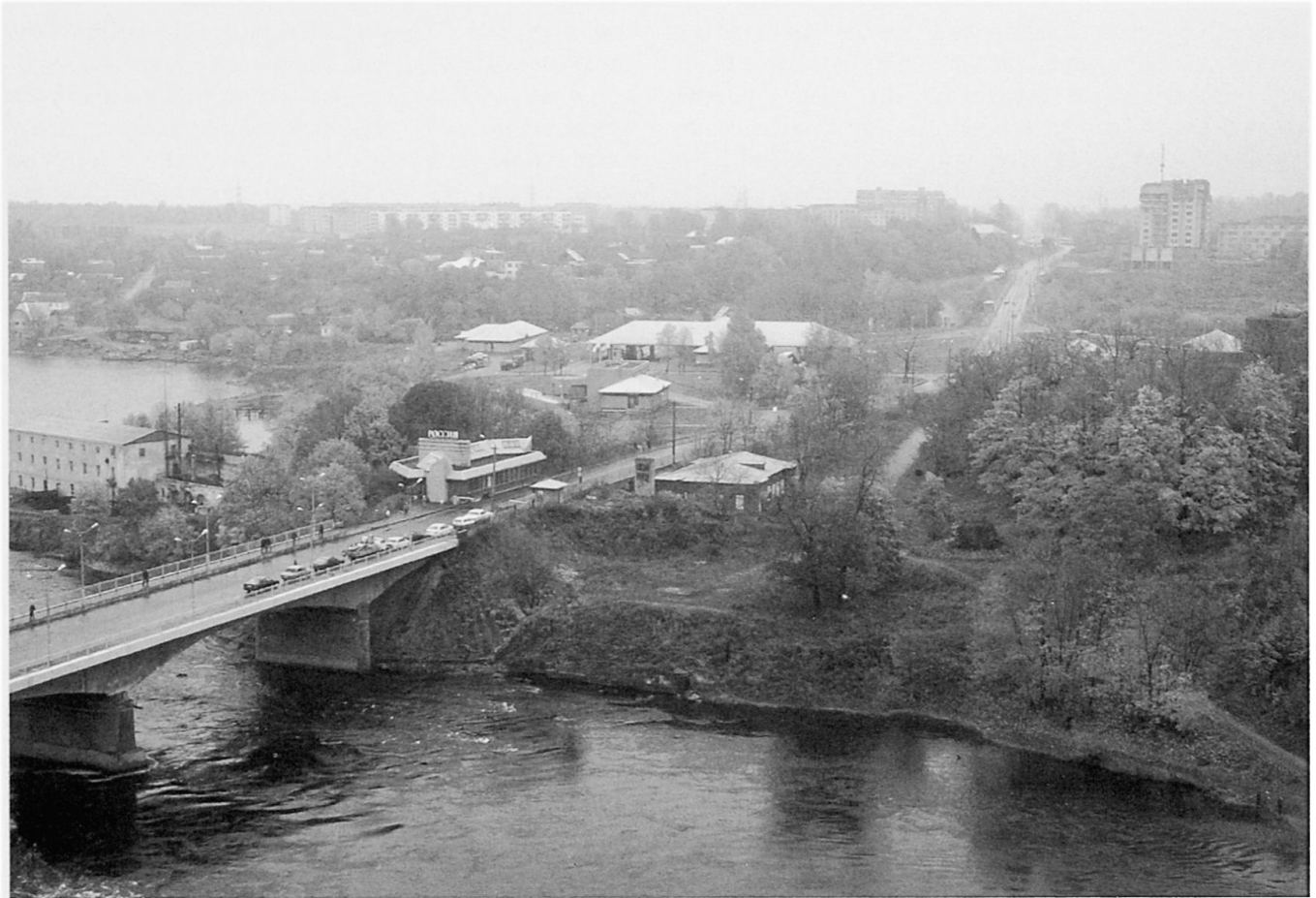
Fig. 2: The Russian border control and Ivangorod as seen from Narva

Der russische Grenzposten und Ivangorod von Narva aus gesehen