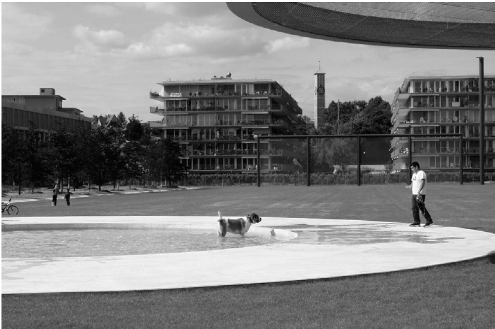
Fig. 3: Water basin at Wahlenpark with ball catch fence and flood light post in the background Das Wasserbecken im Wahlenpark, im Hintergrund das Ballfanggitter und der Flutlichtmast Le bassin du Wahlenpark avec en arrière-plan la barrière et le projecteur Photo: by courtesy of F. SCHMIT, summer 2005

In the following section, attention is given to the ways people sojourning at Wahlenpark deal with these opportunities – what kinds of spaces do park users produce?