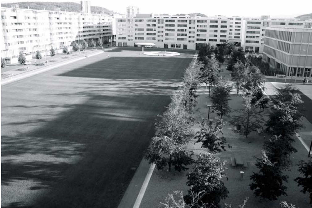
Fig. 2: Bird's eye view of Wahlenpark in Zurich (Switzerland) with the bosk on the right, the lawn in the centre, the concrete element on the left and the water basin in the background

Der Wahlenpark in Zürich (Schweiz) aus der Vogelperspektive. Auf der rechten Seite ist der Buchenhain zu sehen, in der Mitte die Spielwiese, links der Sitzbalken und im Hintergrund das Wasserbecken.