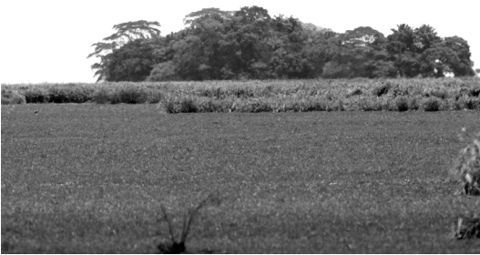
Fig. 3 a: Island in bajío with Cyperus giganteus and Thalia geniculata in foreground, La Chacra, Provincia Cercado Waldinsel in einem «bajío» mit Cyperus giganteus und Thalia geniculata im Vordergrund, La Chacra, Provinz Cercado Îlot forestier dans le bajío avec Cyperus giganteus et Thalia geniculata au deuxième plan (La Chacra, Province de Cercado) Photo: R. LANGSTROTH, December 2003

The Llanos de Moxos fauna includes both forest and open formation elements of diverse origins, including