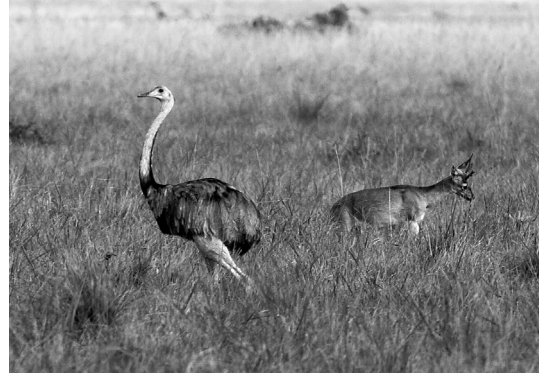
Fig. 5: Southern South American open formation fauna, Rhea americana and Ozotoceros bezoarticus , Barba Azul Nature Reserve, Yacuma Province, El Beni

Fauna offener Vegetationsformationen des südlichen Südamerikas, Rhea americana und Ozotoceros bezoarticus, Barba Azul Naturreservat, Yacuma Provinz, El Beni