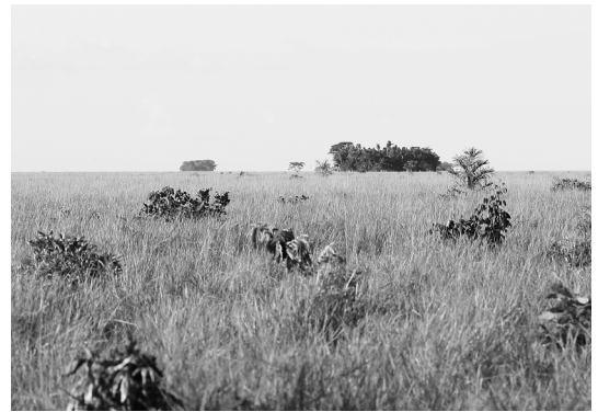
Fig. 3 b: Islands in worm-mound «sartenejal» grasslands, Campo sujo Cerrado grasslands in foreground, Barba Azul Nature Reserve Waldinseln in «sartenejal» Grasland mit Wurmhügeln und Campo sujo Cerrado Grasland im Vordergrund, Barba Azul Naturreservat Îlots forestiers avec monticules herbeux (sartenejal), prairies de Campo sujo Cerrado au deuxième plan, Réserve naturelle de Barba Azul Photo: R. LANGSTROTH, October 2009