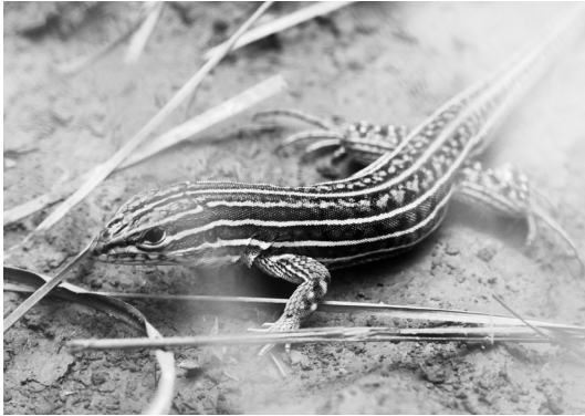
Fig. 6: Kentropyx vanzoi in grassland at Barba Azul Nature Reserve, Yacuma Province, El Beni, Bolivia Kentropyx vanzoi im Grasland des Barba Azul Naturreservates, Yacuma Provinz, El Beni, Bolivien Kentropyx vanzoi dans les prairies de la Réserve naturelle de Barba Azul, Province de Yacuma, El Beni, Bolivie Photo: R. LANGSTROTH, October 2009

Widespread Cerrado ( Chrysocoyon brachyurus , Kunsia tomentosus ), grassland ( Blastocerus dichotomus , Euphractus sexcinctus , Ozotoceros bezoarticus ), and habitat generalists ( Hydrochoeris hydrochaeris , Panthera onca , Puma concolor , Tapirus terrestris , Tayassu pecari ) are present. Cryptonanus unduaviensis is a micro-marsupial known only from wooded termite mound islands of the flooded savannas of the Llanos de Moxos and the Huanchaca region (Voss et al. 2005). The rat Hylaeamys acritus is known only from the savannas of the Beni and Santa Cruz departments of Bolivia (EMMONS & PATTON 2005). The rats Juscelynomyx guaporensis and J. huanchacae were described from the Huanchaca savannas (EMMONS 1999) but are also in the Iténez savannas. In contrast to the Cerrado ties of the above, an unnamed clade of Calomys endemic to the Beni is most closely related to C. fecundus from the Subandean Chaco, not C. callosus of the Cerrados and Chiquitania (ALMEIDA et al. 2007).