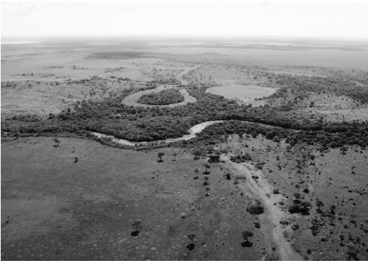
Fig. 2: Llanos de Moxos landscape with forested alturas , sparsely wooded semialtura , and open herbaceous bajío units corresponding to natural levees, backslopes and splays, and flood basins, respectively Llanos de Moxos mit bewaldeten Erhebungen, spärlich bewaldeten mittleren Höhenlagen und offenen krautreichen «bajíos» . Das lokale Relief wird verursacht durch Dammufer, Schwemmfächer und Überflutungsbereiche. Paysage des Llanos de Moxos montrant les hauteurs boisées ( alturas ), les pentes d'altitudes moyennes faiblement boisées ( semialtura ) et les espaces herbeux ouverts ( bajío ) des bassins fluviaux Photo: R. LANGSTROTH, October 2009

NAVARRO 2002). Forests in these dissected «upland» landscapes are limited to narrow stream valleys below the level of the savannas, rather than occurring upon positive relief features as in the southern Moxos landscapes (HANAGARTH 1993). A transitional belt occurs between the Cerrados of the Forebulge and the active whitewater floodbasins where the palaeochannels of the Beni river cut across the plains of southern Moxos, such as at the Barba Azul Nature Reserve (BANR) on the Omi river (Fig. 1 and 4).