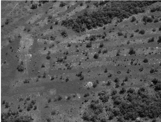
Fig. 7: Abandoned raised fields colonized by shrubs and trees in Cerrado savannas near Iruyáñez River, Yacuma Province, El Beni. White spots are termite mounds.

In der Nähe des Iruyáñez-Flusses, Yacuma Provinz, El Beni, sind aufgelassene Hügelbeete durch Büsche und Bäume der Cerrado-Savanne besiedelt. Weisse Flecken sind Termitenhügel.