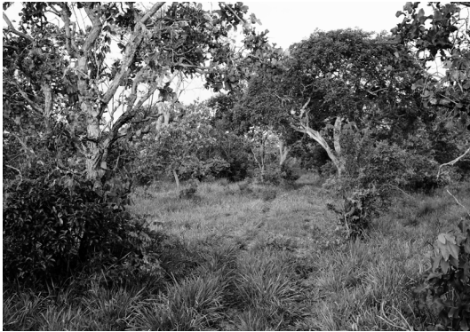
Fig. 4: Cerrado vegetation on semialtura of the Omi river, Barba Azul Nature Reserve, Yacuma Province, El Beni, Bolivia

Cerrado-Vegetation mittlerer Höhenlagen am Omi-Fluss, Barba Azul Naturreservat, Yacuma Provinz, El Beni, Bolivien