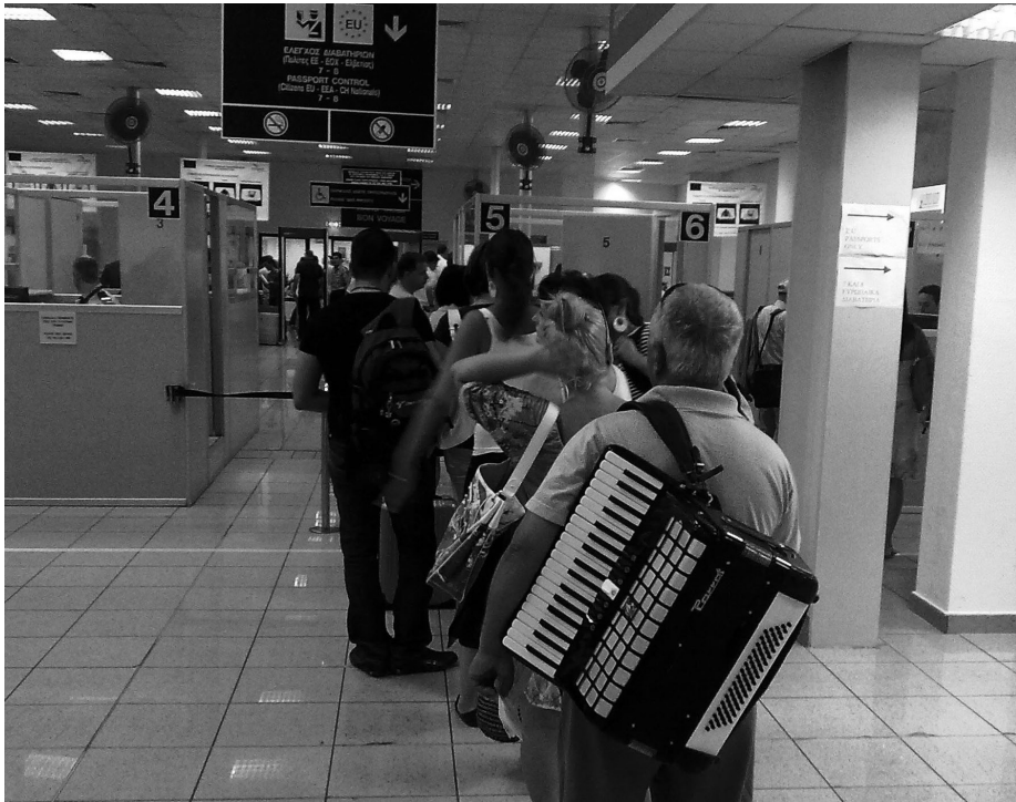
Fig. 2: The Schengen border in Larnaca, Cyprus Die Schengen-Grenze in Larnaka, Zypern La frontière de l'espace Schengen à Larnaca, Chypre

factors that contribute to migration, and the interactions between these factors. For this reason we have contributed to research on the history of immigration in Switzerland (PIGUET 2009a), the geographical distribution of asylum seekers in Europe (EFIONAYI-MÄDER 2005), the migration of football players (POLI 2004) and sex-workers (THIÉVENT 2010a, b), and the migration intentions of students in West Africa. We have also recently developed a new focus on the effects of global warming on migration. These issues are studied through the use of case studies (including Bolivia, Iran, Niger and Peru), as well as from a theoretical and epistemological perspective (PIGUET et al. 2011). The IGG's research on this topic will contribute to the IPCC's fifth report on the social consequences of climate change.