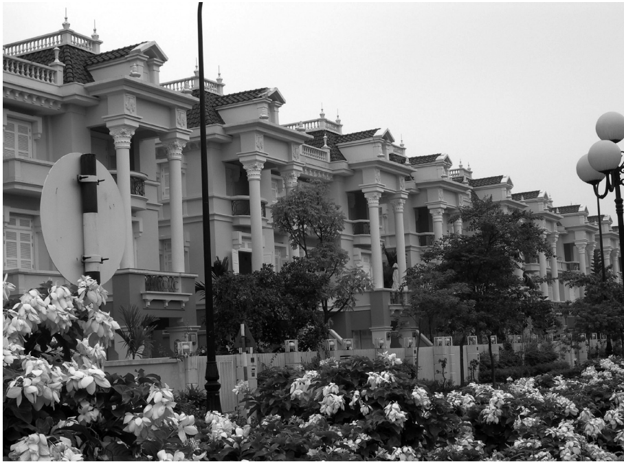
Fig. 3: The gated community as a recently introduced urban type in Hanoi, Vietnam Eine geschlossene Wohnanlage als kürzlich eingeführter städtischer Siedlungstyp in Hanoi, Vietnam La communauté fermée: un nouveau type d'habitat urbain à Hanoi, Vietnam Photo of Ciputra Hanoi International City by O. SÖDERSTRÖM

tices have been following this trend with traditional-modernist approaches being supplanted by models of city planning geared towards the attainment of greater sustainability (CROT 2010b; RYDIN 2010). Not all successful experiences of sustainable planning, however, get to travel. Only a few schemes have achieved such widespread recognition as to be replicated by several municipalities across the world. Our research bears on the global mobility of one such «frequent flyer» scheme, known as One Planet Living, and on the politics of its adoption by local authorities before and upon touching ground in host cities (CROT 2012). The evidence drawn from our case studies – set in Abu Dhabi and San Francisco – emphasises the complex dynamics of policy mobilities and reinforces previous findings regarding the importance of the political games and conditions that underpin transferring processes (CROT 2010c, 2011).