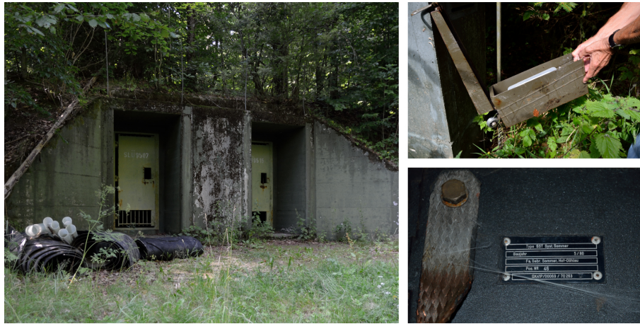
Figure 3. Bunker complex for demolition material intended for preconstructed obstacles; a geocache in an old ammunition box chained to a lightning rod on a bunker ventilation shaft and a manufacturing label on a blast-proof door (clockwise).

War II. In Germany, politics of remembrance of the Cold War largely concern the sites of injustice in the German Democratic Republic (GDR) and German division (cf. Kaminsky, 2007). Recently, however, relics of Cold War militarisation in the former West, like military establishments, civil defence bunkers, and similar structures, have been identified as relics of the Cold War. This broadens public understanding of which places are to be seen as constituting a landscape of memory of the Cold War.