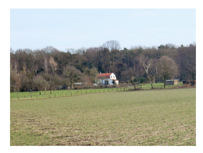
Figure 3. Property of Mr and Mrs Evans, photo by Maartje Bulkens.

uments and maps, such as openness, sight lines, unbroken area and "very striking views" – hold real implications beyond the representational ; indeed, notwithstanding the historical foundations of these representations of the landscape, they have nevertheless led to actual material interventions in the landscape, such as the removal of trees. We would like to argue then that representations of the landscape, although contested, often remain important elements, or even 'acts', in shaping the materiality of the landscape: by being reiterated and reinforced in the planning process they gain the power to impact upon the landscapes and its residents and users. Landscape representations, in other words, maintain actual effects on the spaces where people live and with which they identify; or, at least, this is illustrative of the Wageningse Eng and possibly of many other Dutch cases.