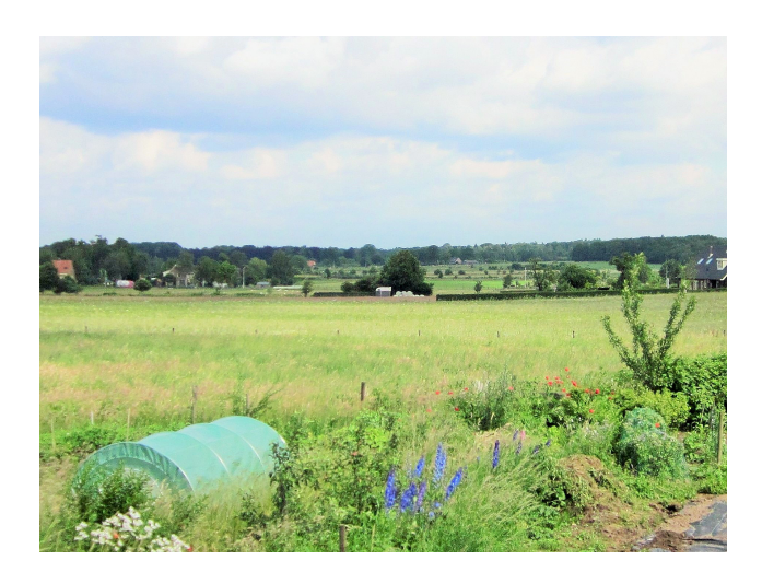
Figure 1. The Wageningse Eng, south side.

years, however, the actual use of the Eng for agricultural purposes has been rather limited given its unprofitability, resulting in recreational and residential uses becoming more dominant. These include horse keeping, allotment gardening, small-scale biological farming, flower-picking gardens, and the cultivation of trees and plants (see Fig. 1) (Renes, 1993; Gemeente Wageningen, 2012a, b).