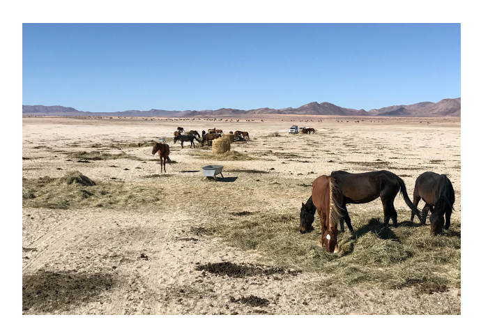
Figure 4. Feeding of the horses with hay (2017, near Garub).

Finally, the Namib horses of today survive because they are supplied with extra food in times of drought. Only as recently as the 1990s did people link the recurring droughts within the past 100 years to the death of many horses. The growing interest in environmental tourism made the situation visible to the public, on both a national and an international level. When a heavy drought towards the end of the 1990s resulted in visions of haggard and dying horses, public exclamations and emerging private initiatives, in particular the Namibia Wild Horses Foundation (NWHF), put pressure on the Ministry of Environment and Tourism. As a result, it became legal to feed the horses with hay in times of drought (Fig. 4).