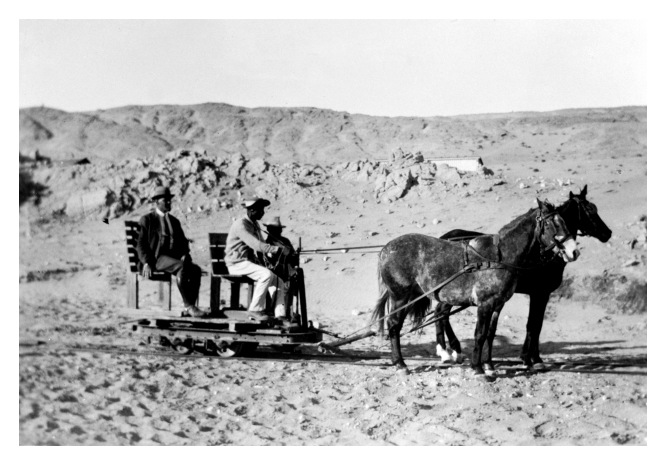
Figure 2. Working horses on the diamond fields.

An air strike near the settlement of Aus dispersed thousands of stationed cavalry horses during the war. They mixed with the breeding horses from a deserted stud farm south of Aus. Gathered in larger herds and driven by the search for water, they finally found a well close to Garub. This well, ac-