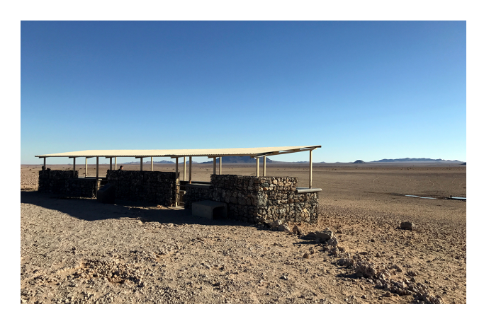
Figure 5. Observation point. Co-constitution of wildlife in the "natural–cultural contact zone" (Haraway ,2008): drinking troughs guide the horses towards tourist viewpoints and help designate how and where horses trod upon, and thus shape, the landscape (2017, Garub).

cially formed relations. The horses themselves, if we accept their agency, elude clear-cut classification. In their relation to humans, a border between nature and culture is elusive, depending on the (human) interests at hand. At the same time, following Lorimer (2007), horses bear a specific aesthtetic, ecological and corporeal charisma in the form of "biopower". This charisma oscillates between what humans categorize as nature or culture because it involves the biopower that emerges through interactions between humans and non-humans. Moreover, perhaps more than any other species, horses symbolize the human longing for a fusion with nature, as expressed for thousands of years in the symbol of the centaur. Their deeply hybrid character, the horse thing (see quote below), as emerging from or as arising through hundreds of years of living with humans, resists classification, both in discursive and material practice: