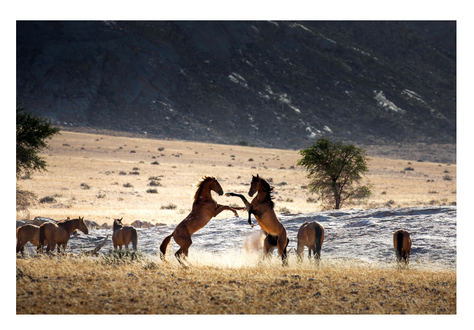
Figure 6. "Performing" stallions (2018, near Garub).

material body, hence the physical body one "has" *Sörper encompasses the material body as well as the socially constructed image of one's material body. Leib is the body with which we experience the world and with which we express ourselves to the world. According to this distinction we can understand practices of the park management as Körper practices, be it efforts in population control, the territorial distribution of animals and their bodies, the establishment of norms of healthy animal bodies, or the assignment of a particular role in the local ecosystem. In the sphere of the Leib, in contrast, we find all aspects of emotion and affect of the humans and horses involved, such as fascination, curiosity, empathy or care.