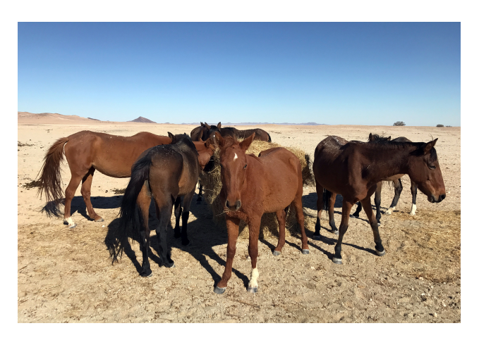
Figure 7. "I live in the facial expressions of the other, as I feel him living in mine." (Merleau-Ponty, 1964:146): a moment of intercorporeality in a feeding situation (2017, near Garub).

<sup>9</sup>Etymologically, Körper stems from Latin corpus , similar to "body" from Old English bodig : referring to the "physical structure of a human or animal; material frame, material existence of a human" (https://www.etymonline.com/, last access: 15 January 2020).